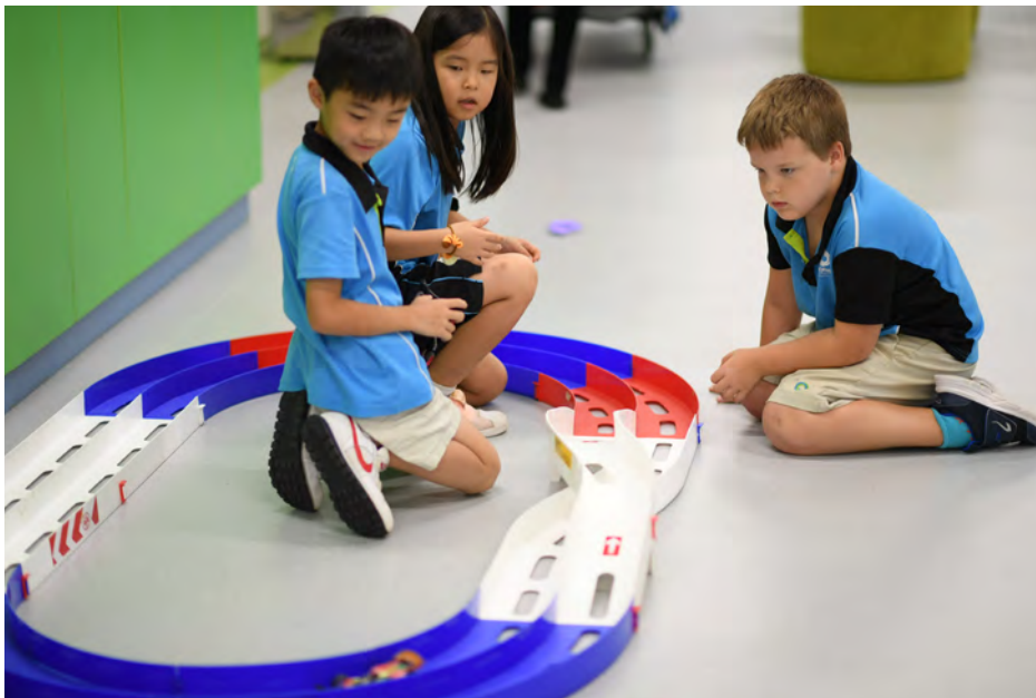
NEXUS INTERNATIONAL SCHOOL (SINGAPORE)

Love to help out backstage? Interested in how our Lights, Sound and special effects work? Want to support school shows? Come along to the Tech club and learn how to operate our control booths and more!